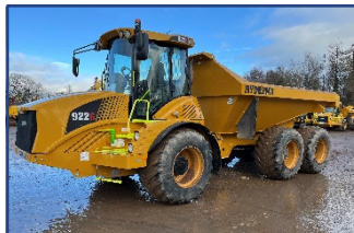
Hydrema 922G Year 2023 | £169,500