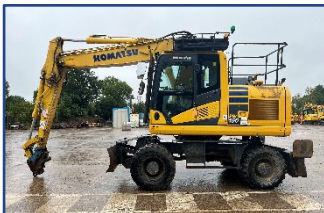
Komatsu PW160 Year 2022 | £POA