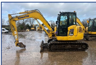
Komatsu PC80 Year 2022 | £45,000