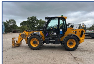
JCB 540-140 Year 2023 | £48,500