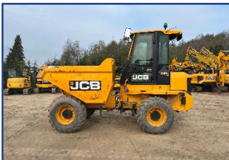
JCB 9T Cab Dumper Year 2021 | £28,500