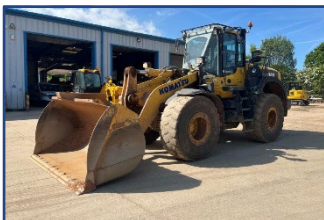
Komatsu WA380-8 Year 2022 | £125,000