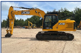
JCB 220X Year 2022 | £68,500