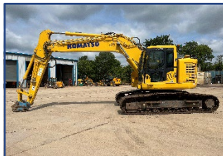
Komatsu PC228USLC Year 2022 | £95,000