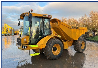
Hydrema 912G Year 2024 | £115,000

All Machinery is sold with Full Service History & one month Warranty (UK)