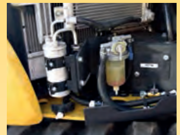
Large fuel filter and fuel pre-filter with water separator protect the engine