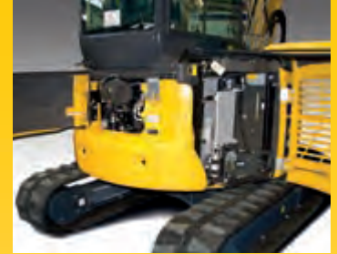
Rear bonnets for quick engine checks, simple inspections, cleaning of the radiators and easy access to the battery

ORFS hydraulic face seal connectors and DT electrical connectors enhance the machine's reliability and make repairs faster and easier. High durability bushings and a 500 hours engine oil change interval further lower operating costs.