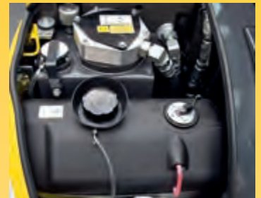
Convenient and save fuel and oil refilling under the front bonnet