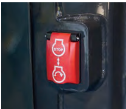
Secondary engine shut down switch