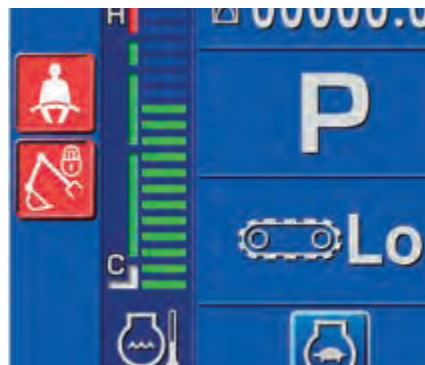
Seat belt caution and neutral position detection system caution