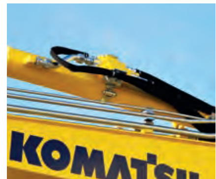
Hose burst valves on boom and arm cylinders